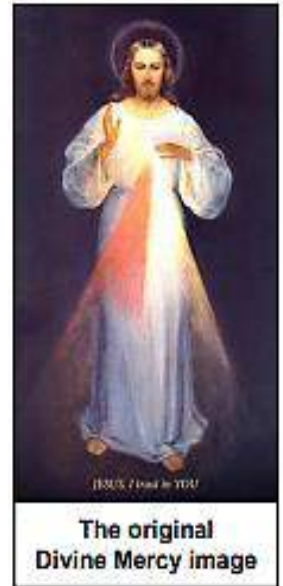
The original Divine Mercy image

Symbolic meaning: The coloured rays streaming out from the heart of Jesus have symbolic meaning... red for the Blood of Jesus, which is the life of souls, and white for the Baptismal water which justifies souls. The brightest point in the picture is the heart. The light on the forehead signifies the presence of the Father. - The whole image is symbolic of the mercy, forgiveness and love of God.